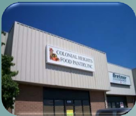
The Colonial Heights Food Pantry 530 Southpark Boulevard