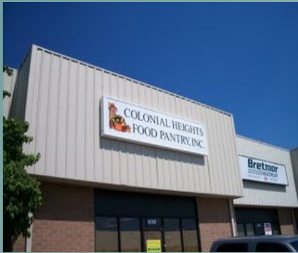
The Colonial Heights Food Pantry, 530 Southpark Boulevard.

We know about the Compass trip to the Colonial Heights Food Pantry for local family food bag filling – 10am on Oct. 24.